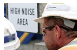
Worker using earplugs for hearing protection.

Make sure your hearing protection fits and is comfortable. The louder the job, the more hearing protection you need. Look at the Noise Reduction Rating of your earplugs or earmuffs to determine the level of sound they block out.